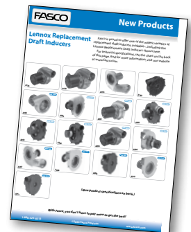
Draft Inducer Cut Sheets