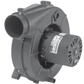
Fasco leads the industry with more direct replacement draft inducers, like the A276 for Trane.

For more information on our complete line of direct replacement draft inducers, just contact your Fasco Sales Representative today, or call our Customer Service Department at 1-800-325-8313.