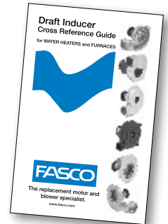
Draft Inducer Cross Reference Guide

To order your free copies of these handy references, just call our Customer Service Department at 1-800-325-8313.