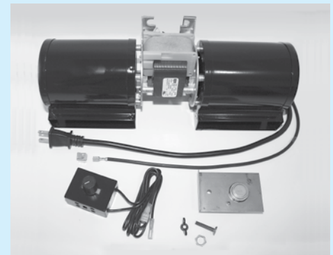
B160 Blower System