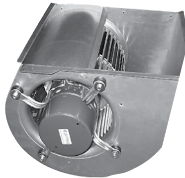
High Efficiency Blower (HEB)

Targeted applications include HVAC appliances such as furnaces, fan coil units, air handlers and ground source heat pumps, or in general air moving applications where low energy usage is important.