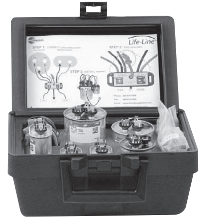
The Life-Line Capacitor Kit LCKG – Genteq Capacitors Included LCKP – Proline Capacitors Included