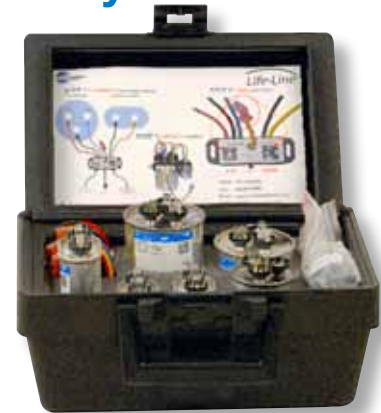
The Life-Line Capacitor Kit LCKG – Genteq Capacitors Included LCKP – PROLINE Capacitors Included

The Life-Line Capacitor Kit is a handy all-in-one replacement source for single and dual run capacitors. In addition to many single capacitor ratings, the kit was designed to also cover 48 of the most common dual ratings in both 370VAC and 440VAC applications. In fact, it covers 85% of the ratings in the field today! And since it has everything your customers need to select, wire and mount replacement capacitors in one convenient kit, the Life-Line Capacitor Kit saves them