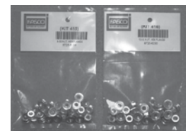
Fasco's new Kit415 and Kit416 Nut Kits.

You asked for it, so we went a little nuts – by introducing two new lines of Fasco nut kits, that is. Installers and distributors told us that the nut diameter on our existing Kit832 and Kit1032 Nut Kits were not large enough in some applications. So we listened and created these new kits with nuts that are larger in diameter and provide a more robust mounting face.