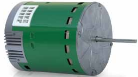
The Evergreen EM is available in 1/3, 1/2, 3/4 and 1 HP 115V models.