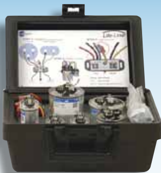
The Life-Line Capacitor Kit is available in two models: LCKG, with Genteq® Capacitors and LCKP, with PROLINE™ Capacitors.