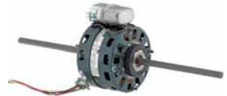
The D258, D277 and D354 5.0" Fan Coil Air-Conditioning Motor.

Fasco has a wide range of replacement motors that are perfect for your summer stocking needs, including a full assortment of 5.0" diameter Fan Coil Air-Conditioning and Heating Unit Motors. Our open-ventilated, PSC models like the D258 , D277 and D354 have proven to be especially popular choices. The D258 is a 2-speed motor with 1/5-1/10 HP, 208-230 Volts, 1550 RPM and 2.8-1.3 Amps. The 3-speed D277 features 1/10-1/12-1/20 HP, 277-Volts,