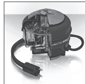
ARKTIC SSC 2 ECM Motor

For more information on the new ARKTIC 59 and ARKTIC SSC 2 ECM motors, contact your Fasco Sales Representative or our Customer Service Department at 1-800-325-8313.