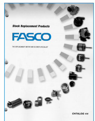
Fasco's new Stock Replacement Products Catalog #44 is now available!

To request your free copy, just contact your Fasco Sales Representative or our Customer Service Department at 1-800-325-8313. You can also see a content listing and download PDFs of the new Catalog #44 by visiting our website at fasco.com . Just click on "Stock Replacement Products" on the drop down menu under the "Distributor Services" tab at the top of the page. Then click on "Product Categories – Catalog 44."