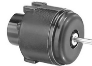
FIG. D D578, D579, D580, D581