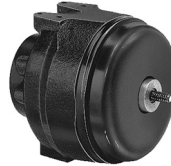
FIG. C D570, D571, D572, D573, D574, D575, D576, D577