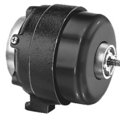
FIG. B D566, D567, D568, D569