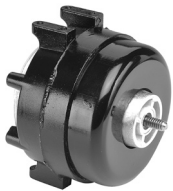
FIG. A D550, D551, D552, D553, D554, D555, D556, D557, D582, D583, D558, D559, D560, D561, D562, D563, D564, D565

NOTES: 45: Speed nut and vibration damper included. 124: All mounting holes drilled and tapped. 143: All motors individually boxed. 145: Interchangeable with GE 21 & 29 Frame motors and other Emerson, Universal and Franklin refrigeration motors